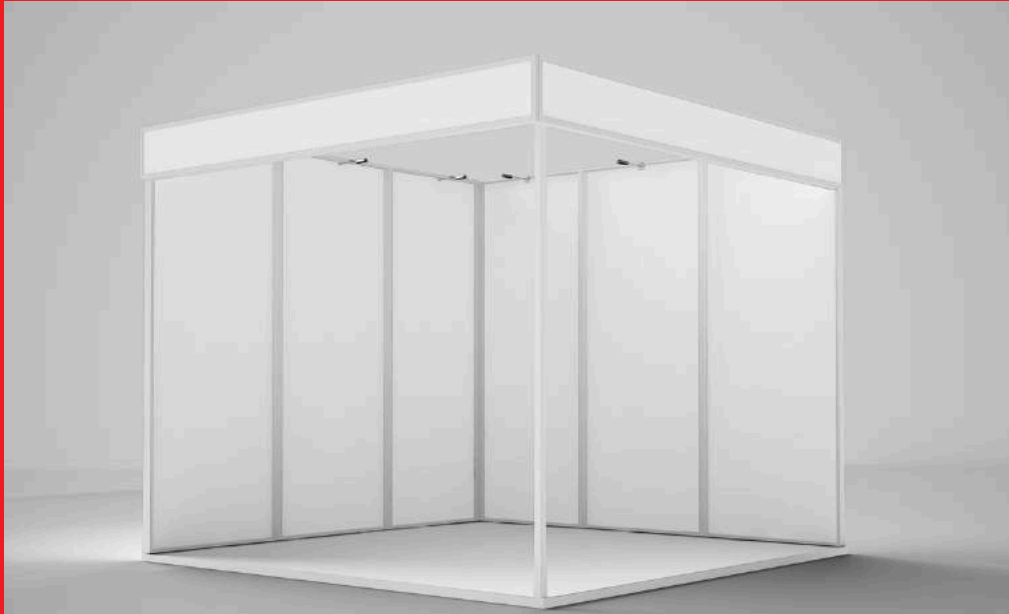
STANDARD SHELL SCHEME