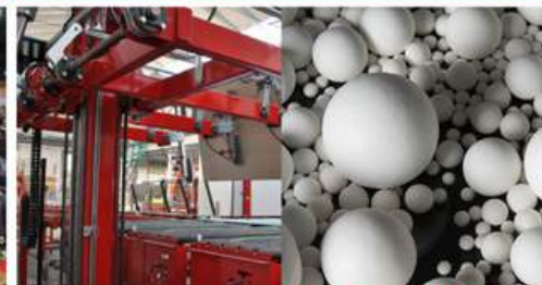
CUTTING-EDGE MACHINERIES, TECHNOLOGIES & MATERIALS