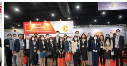
HOSTED BUYER PROGRAM