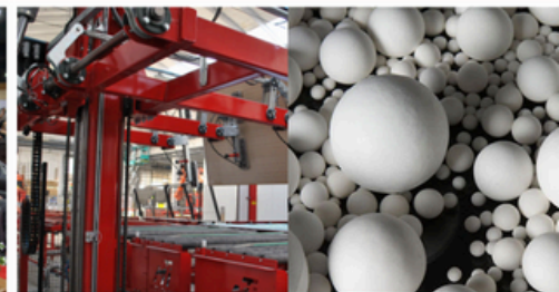
CUTTING-EDGE MACHINERIES, TECHNOLOGIES & MATERIALS