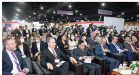
PRESENCE OF KEY INDUSTRY LEADERS