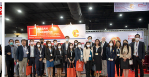
HOSTED BUYER PROGRAM