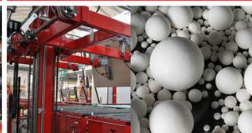
CUTTING-EDGE MACHINERIES, TECHNOLOGIES & MATERIALS