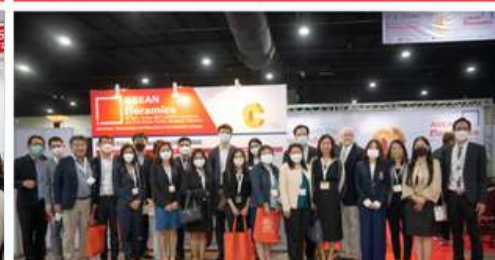
HOSTED BUYER PROGRAM