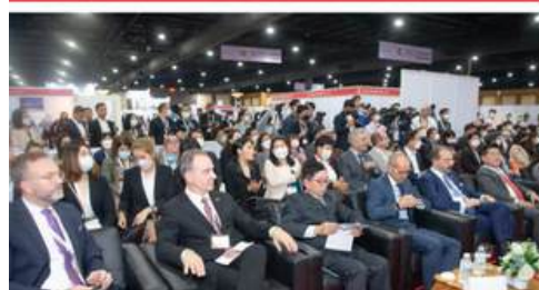
PRESENCE OF KEY INDUSTRY LEADERS